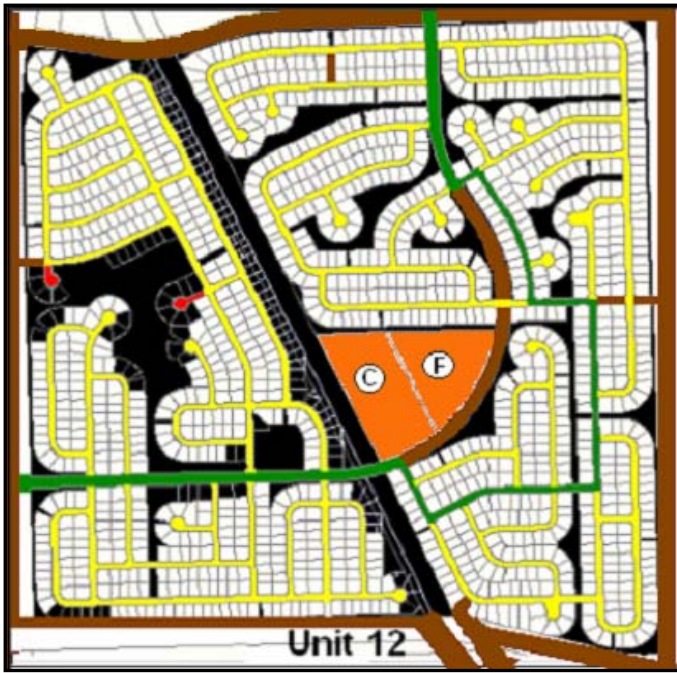
Figure 5. Unit 12 with a color key representing lots and pipes.