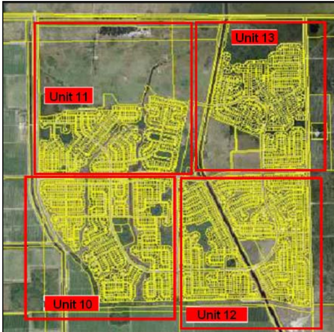
Figure 2. GIS map of Banyan Village from http://hendryprop.com .