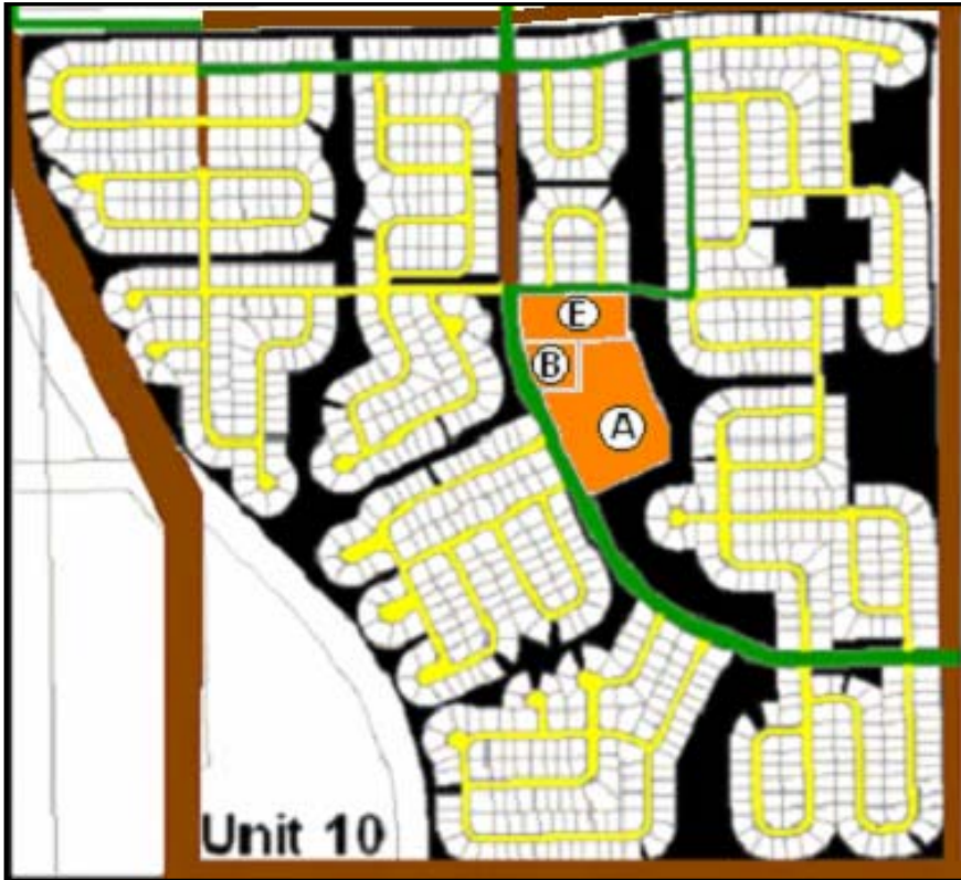
Figure 3. Unit 10 with a color key representing lots and pipes.