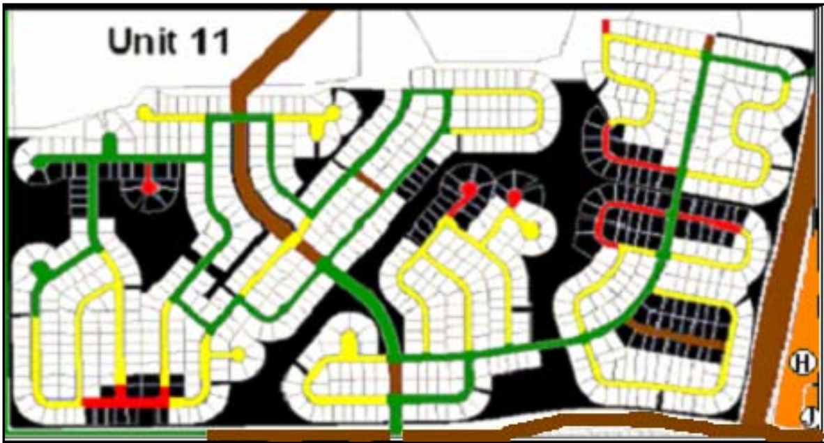
Figure 4. Unit 11 with a color key representing lots and pipes.