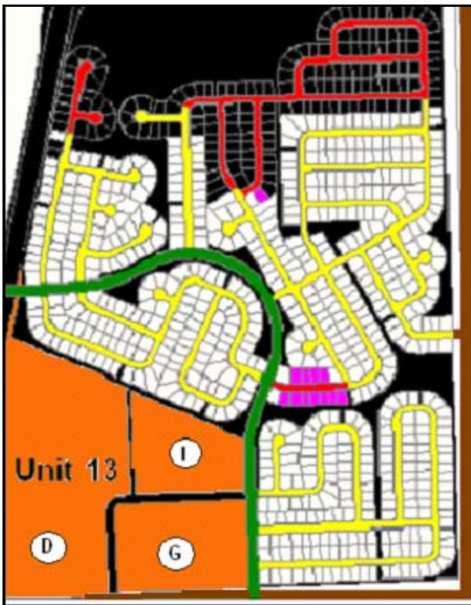
Figure 6. Unit 13 with a color key representing lots and pipes.