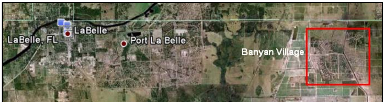
Figure 1. Location of Banyan Village relative to Port La Belle.

Banyan Village is the eastern section of Port Labelle in Hendry County, Florida (see Figure 1). Banyan Village is the eastern-most part of the Port LaBelle Utility System (PLUS) service area.